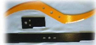
Mowing for a rotary cutting tool