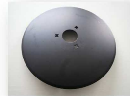
Plowing Colter blade & disk blade