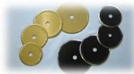
Combine blade、Straw cutting blade, straw cutter(rotary blade)