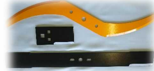
Mowing for a rotary cutting tool